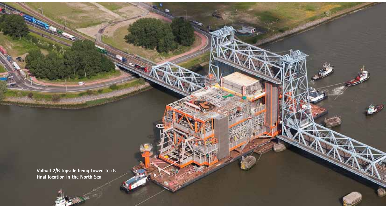
Valhall 2/B topside being towed to its final location in the North Sea

"Over the years, we have automated almost all beam-to-beam connection macros as well as polygon welds within Tekla Structures." This automation speeds up the designing of basic structures and thus allows the designers to focus on more challenging work.