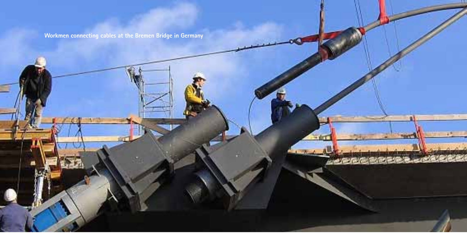
Workmen connecting cables at the Bremen Bridge in Germany