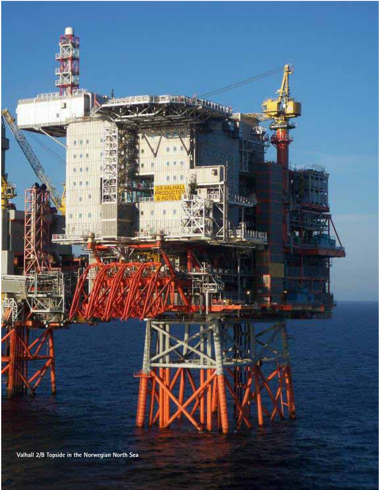
Valhall 2/B Topside in the Norwegian North Sea

"As a result, an extended weldlist of a particular area, or floor or even the whole structure can be provided. This is highly appreciated by our clients' fabrication planning officers as it is a big time saver.